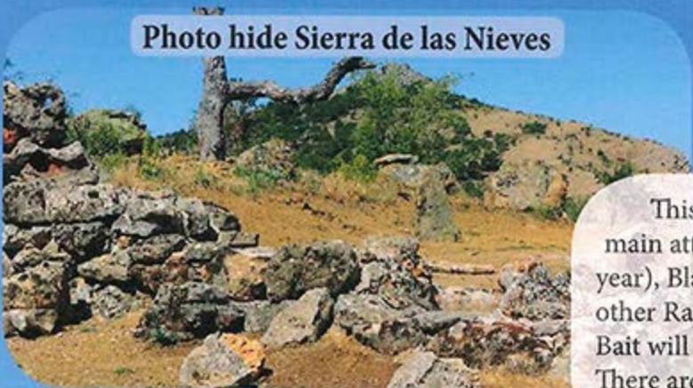
View through spy-glass window

This "Photo Hide" is located near the top of Sierra de las Nieves. The main attraction is to photograph Raptors such as Griffon Vulture (whole year), Black Vulture and Egyptian Vulture (during migration periods) and other Raptors living in the mountains such as Golden and Bonelli's Eagle. Bait will be provided to attract these raptors.