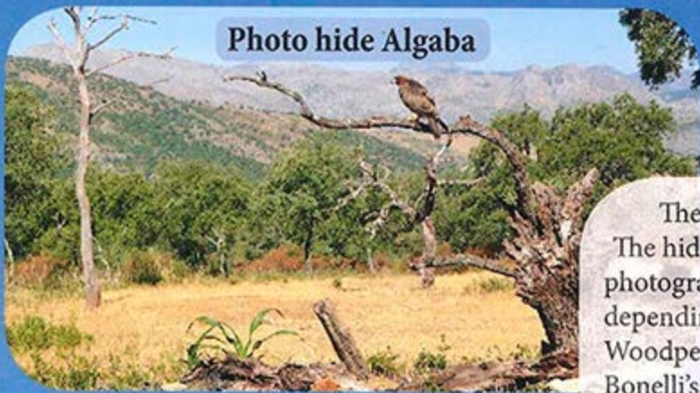
View through spy-glass window

The "Photo Hide" is located in Finca Algaba about 4 km from Ronda. The hide is excellent for a great variety of woodland species, which can be photographed at close quarters. Some of the bird species you may expect, depending on the season, are: Booted Eagle, Buzzard, Green and Great Spotted Woodpecker, Wryneck, Nightingale, Redstart, warblers such as Sardinian, Bonelli's, Subalpine, Melodious, Chiffchaff, Blackcap. Finches, Jay, Bee-eaters, Wood Pigeon, Tits, Dunnock, Nuthatch, Short-toed Treecreeper etc.